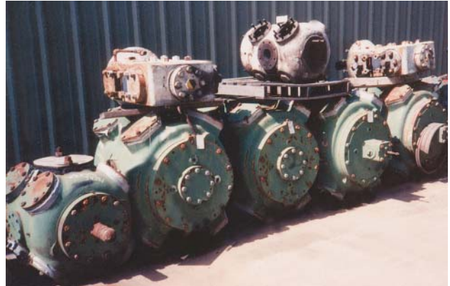
Compressor cylinders to be repaired.